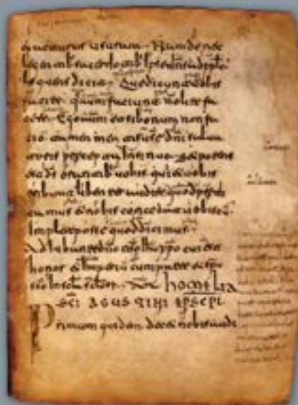
Folio 72r of the San Millán Codex (Códice Emilianense) from the Monastery of San Millán de la Cogolla, where the first written forms of the Spanish language appear.